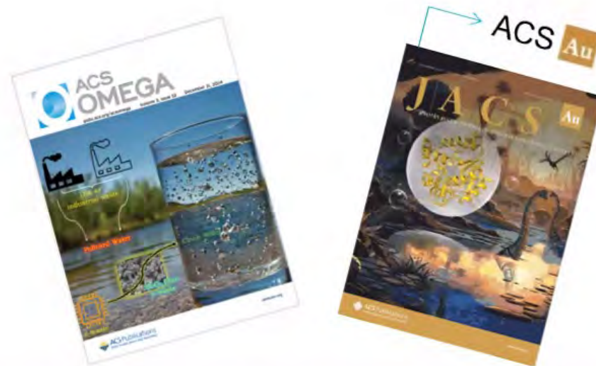
Fully Open Access